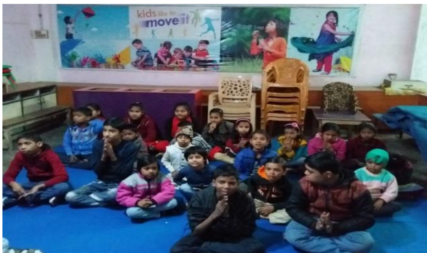
WATCHING TV PROGRAMME