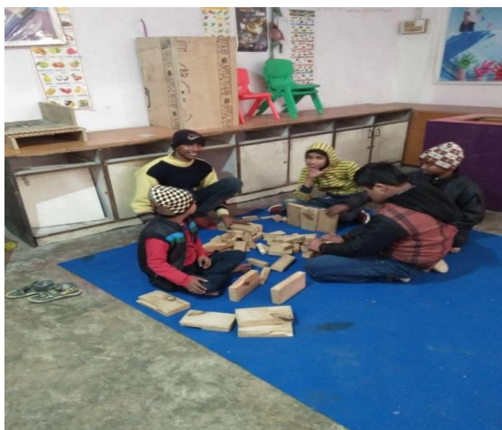
MAKING BUILDING BLOCK