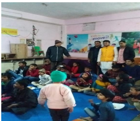
SERVING FOOD BY MEDICAL TEAM KGMU LKO