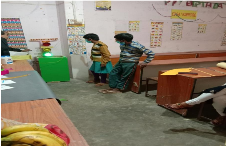
TRAFFIC LIGHT DISPLAY