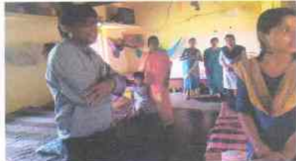
DISTRICT INSPECTION COMMITTEE NAYAGARH