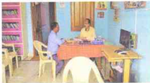
DISTRICT SOCIAL SECURITY OFFICER NAYAGARH