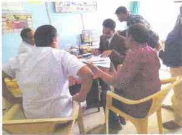
PROGRAMME MANAGEMENT UNIT MINISTRY OF SOCIAL JUSTICE AND EMPOWERMENT, NATIONAL INSTITUTE OF SOCIAL DEFENCE, NEW DELHI