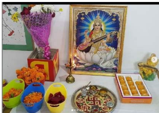
Basant Panchami Celebrations at Aadhaar