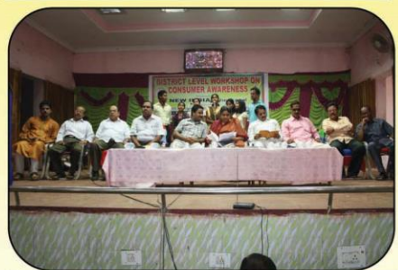
Running Consumer Counseling Center (DCDRF- Dhenkanal, Bargarh & Sundargarh)