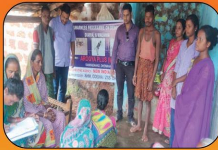
Awareness Program on Ayush