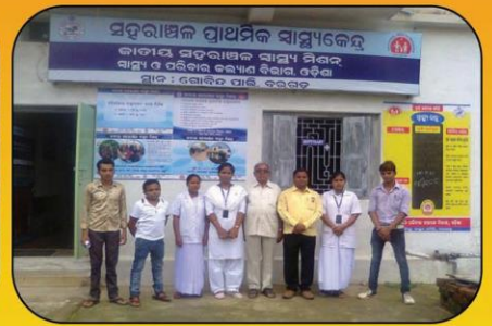
Management of Bargarh UPHC,