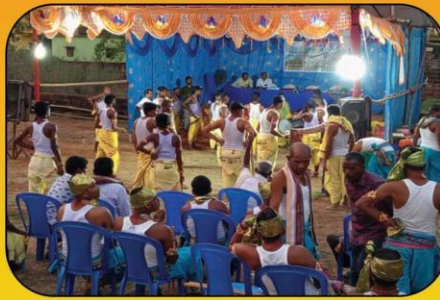
CFPGS (2nd Laudi Festival).