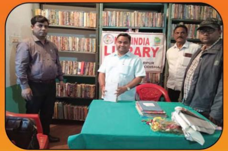
Running New India Rural Library