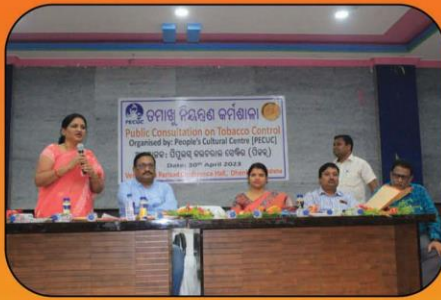
Public Consultation & Tobacco Control (PECUC).