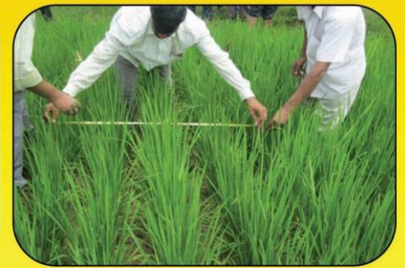
Formation of farmer's producer organisation