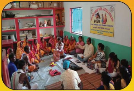
Running New India Lalit Kala & Sangeet Natak Vidyalaya