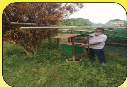
Awareness of Bee Keeping & Honey Processing (SFRUTI)