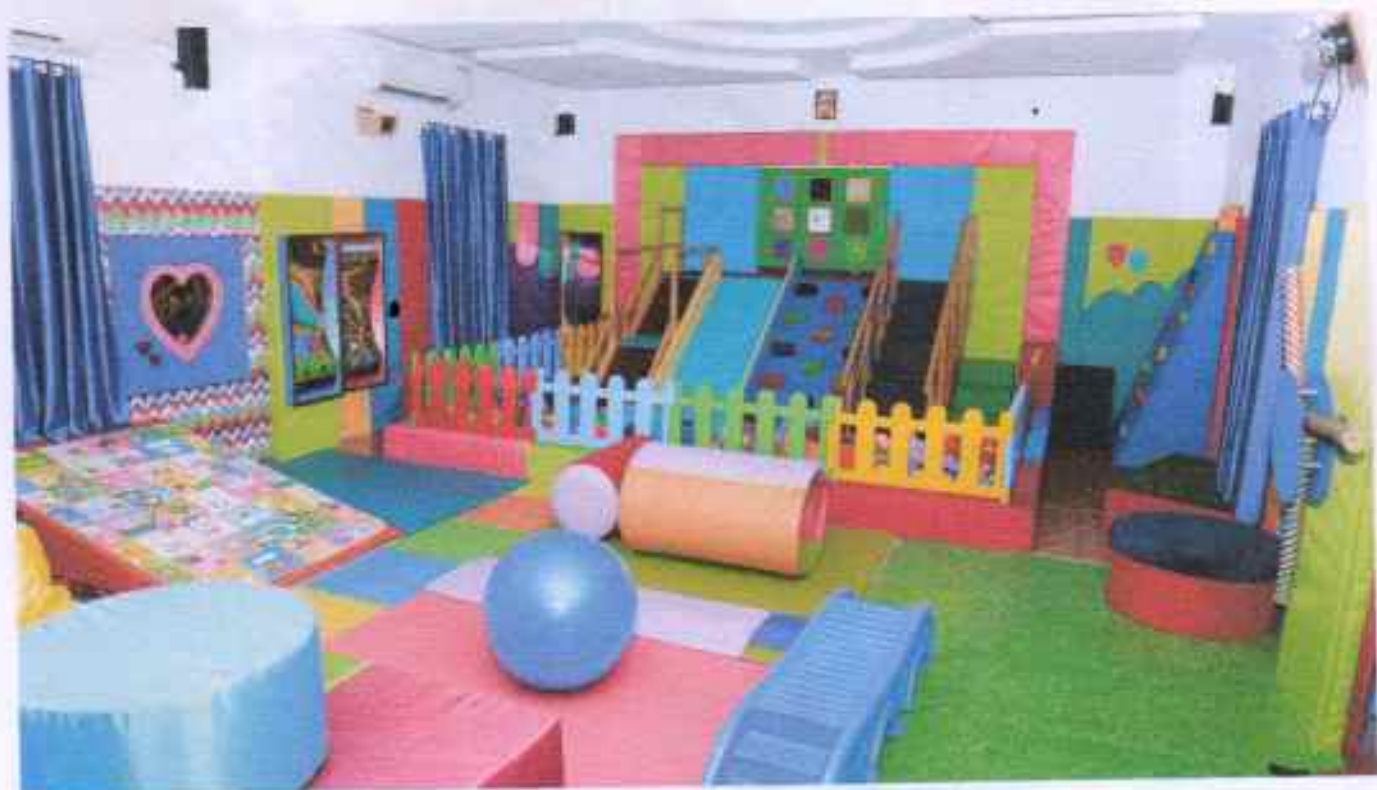
Sensory therapy Unit