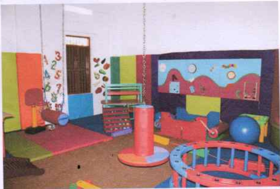
Occupational Therapy Unit