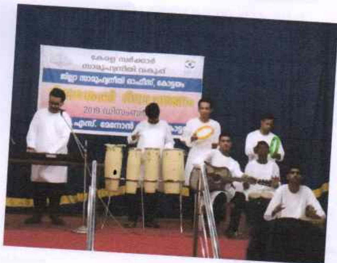
Disabled Day Celebration