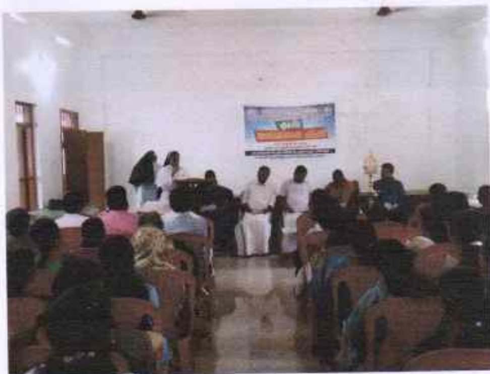
Awareness Class for Parents