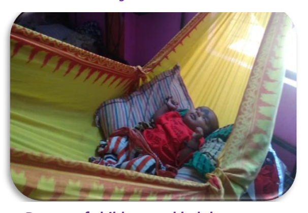
Rescue of children and helpless parent under SUH