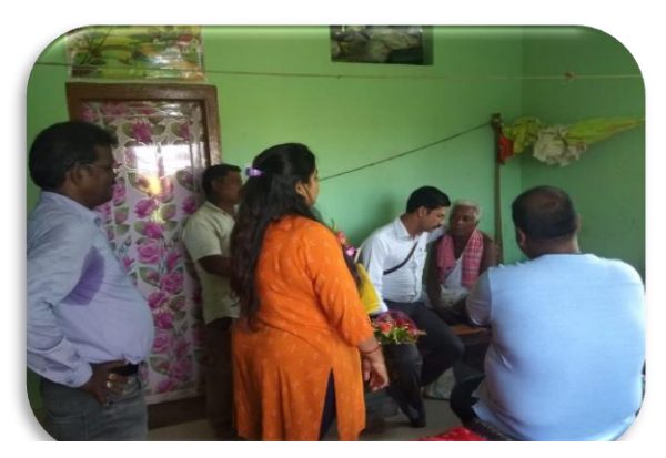
Official from MS & JE Dept. visited Senior Citizen