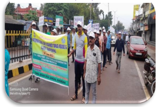
International day against Drug Abouse& illicit trafficking, IRCA, Khordha