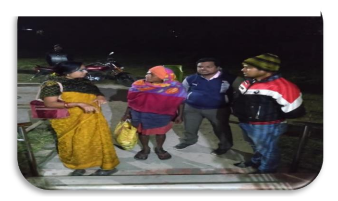
Rescue of helpless under Baripada SUH