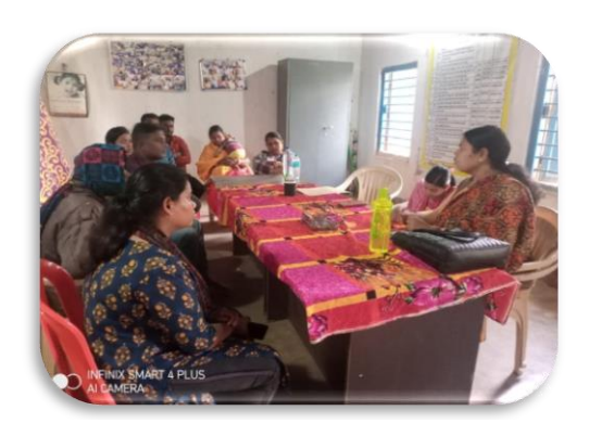
Group Counseling by FCC, Khordha