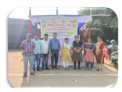
World Aids dayProgramme by TI IDU,