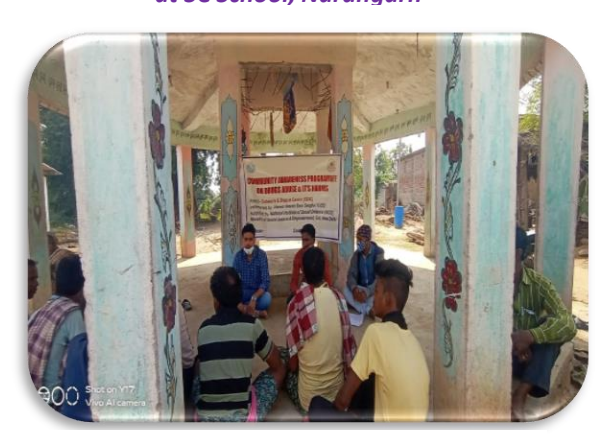
Community AwanessProgramme on Drug Abuse by ODIC, Boudh