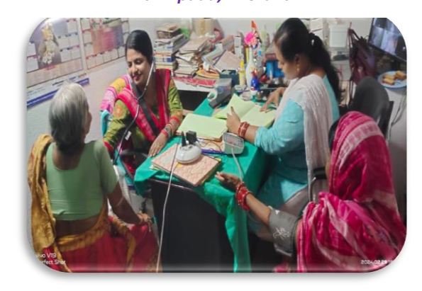
Health Checkup Session of Senior Citizen Home