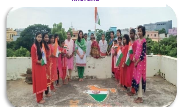
Independent Day Celebration at Open Shelter Home,Bhubaneswar