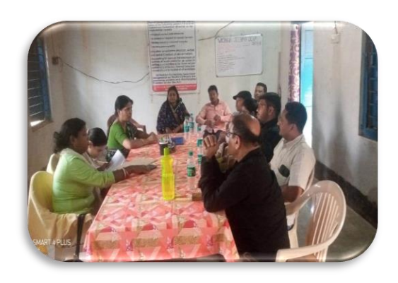
Review Meeting on FCC, Khordha