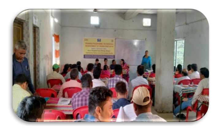
Financial Management PRI Training, Sonepur