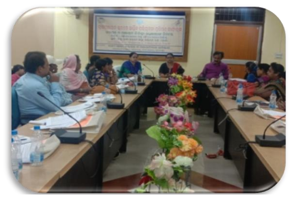
Financial Training of PRI members, Khordha