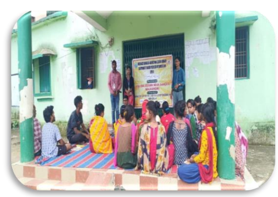
Community Meeting by District De-Addiciton Centre (DDAC), Malkanagiri