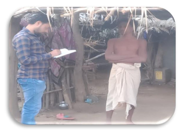
IndivisualConunseling by Out Reach Worker (ODIC, Boudh)