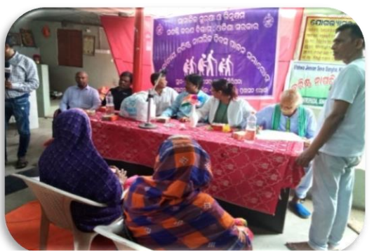
Celebration of Senior Citizen Day, Kimbhiripada, Khordha