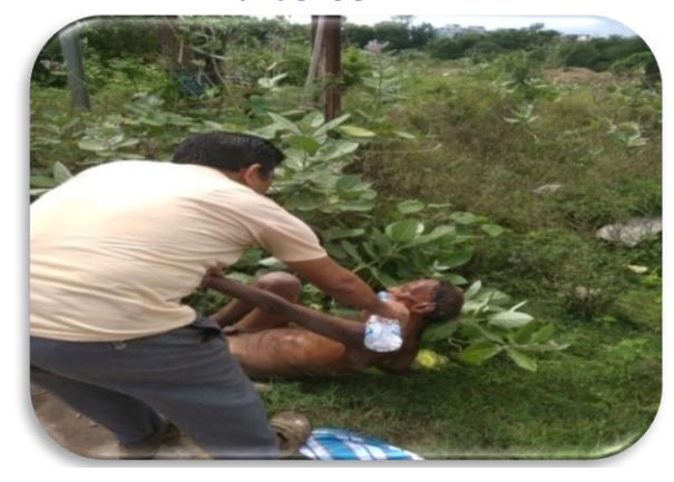
Rescue of ill old man under Boudh SUH