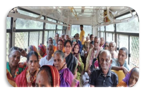
Outing Visit of Senior citizen home Mangarajpur&Kimbhiripada