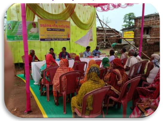
International Senior Citizen Day Celebration by Senior Citizen Home