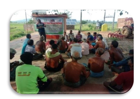
DSR awareness programme at Barasahi GP of Khordha Block