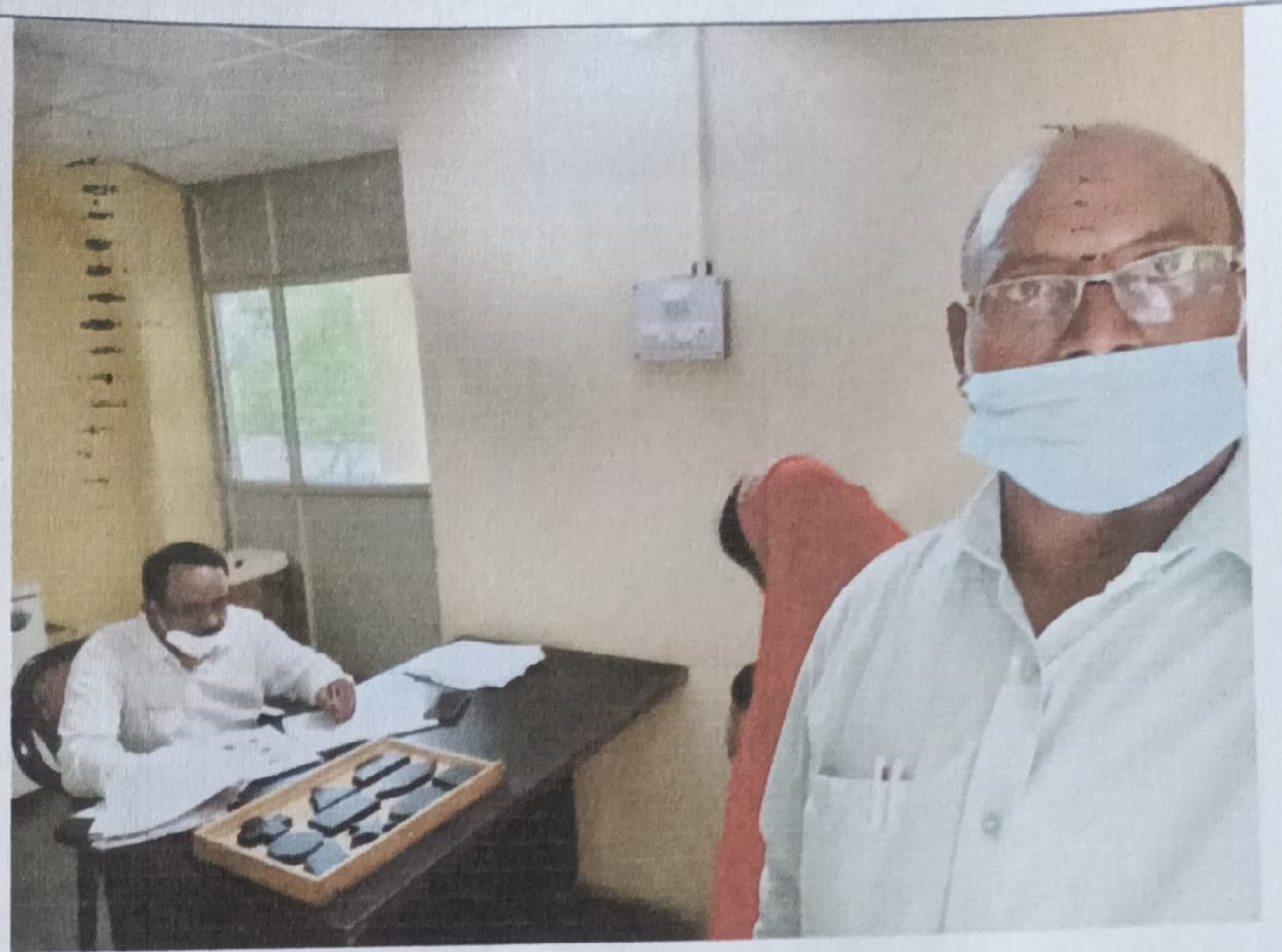
C 20 CHAUPAL FOR GENDER EQUALITY AND DISABILITY