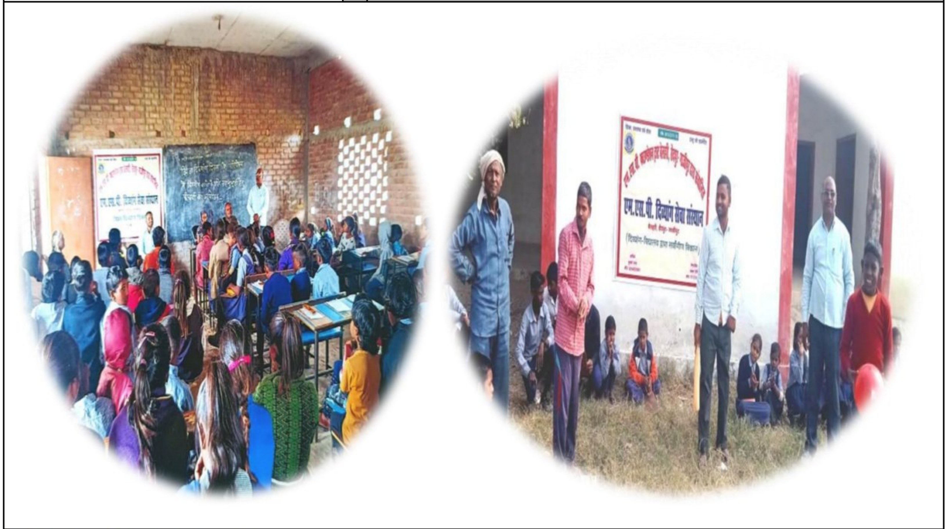
Training & Oreintation Programme

Support Dviyangjans to avail Government Scheme