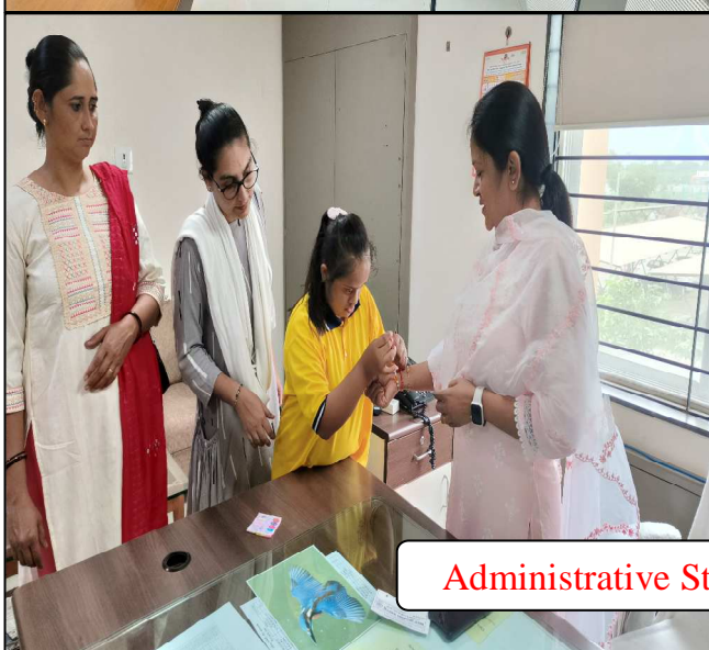
Administrative Staff - Gir Somnath