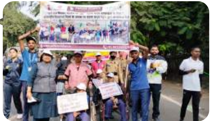
WORLD DISABILITY DAY