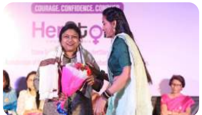
DIVYANG GAURAV SAMMAN