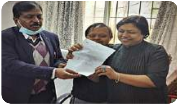
A CERTIFICATE RECEIVED FROM CIVIL SURGEON