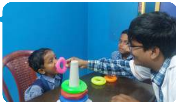
SPEECH & LANGUAGE THERAPY