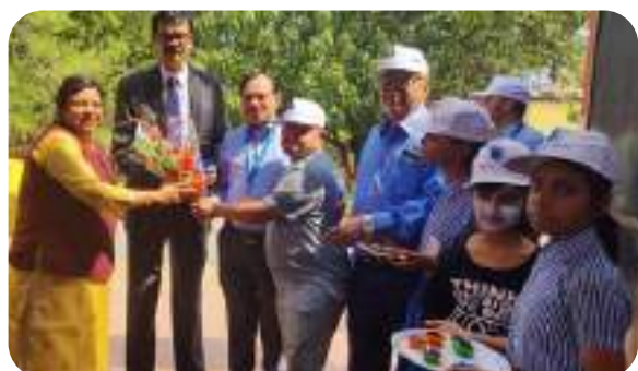
CHAIRMAN, BANK OF INDIA