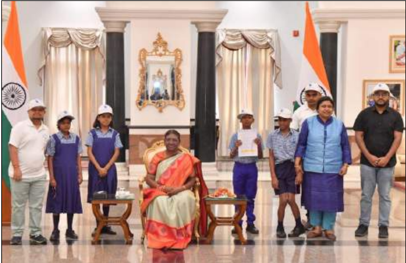
MEETING WITH PRESIDENT AT RASHTRAPATI BHAVAN