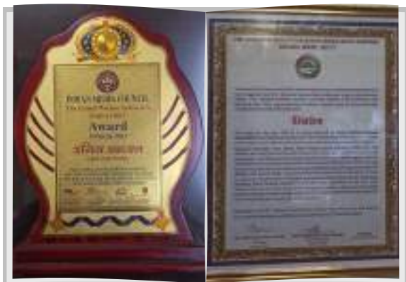
INDIAN MEDICAL COUNCIL GLOBAL WOMEN AWARD