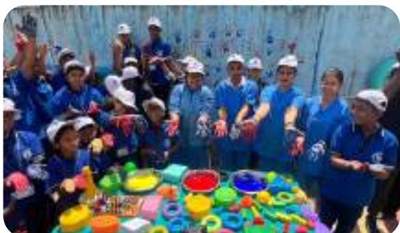
WORLD AUTISM DAY