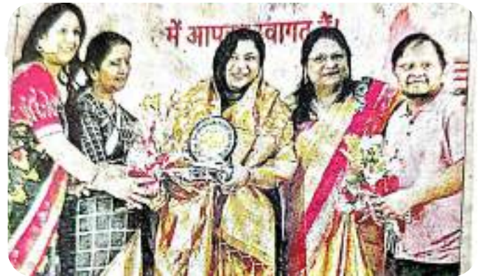
WOMENS DAY AWARD 2023