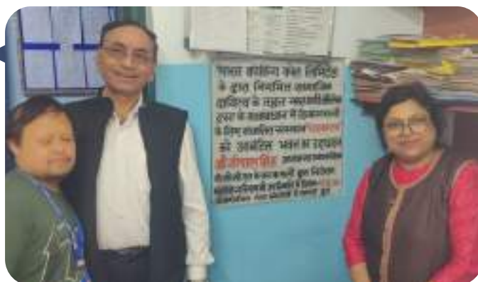
SHRI GOPAL SINGH (EX CMD, BCCL)