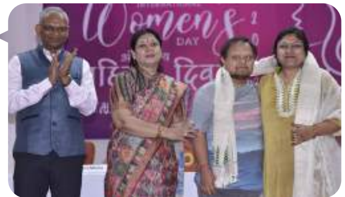
WOMENS DAY AWARD 2024