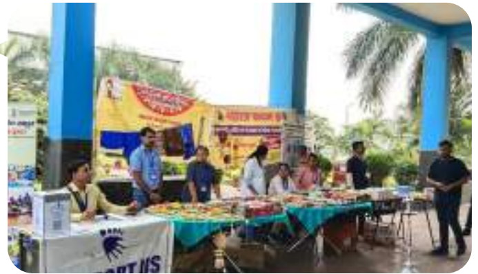
CANDLE MAKING & MARKETING