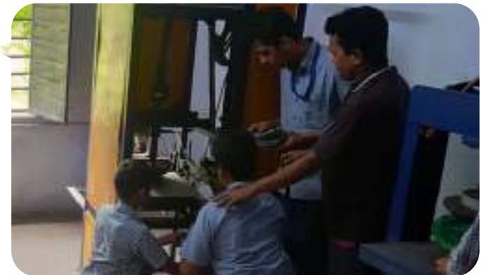
PAPER PLATE MAKING