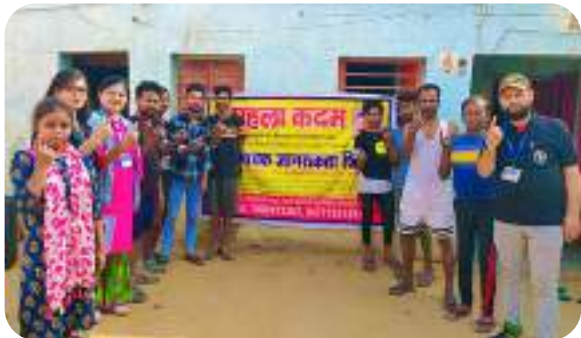
VOTING AWARENESS PROGRAM