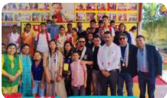
ROUND TABLE, KOLKATA