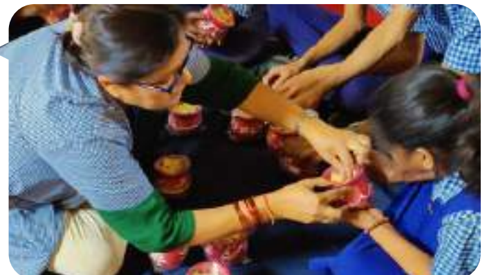
DIYA AND POT DECORATING