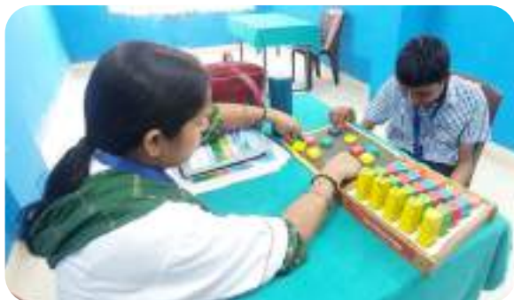
BEHAVIOUR MODIFICATION PROGRAMME